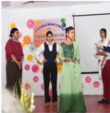
DRAMA - A MIDSUMMER NIGHT'S DREAM