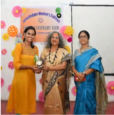
BEST PERFORMER OF ANNUAL EVENT 2018