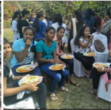
ANNUAL PICNIC 2017