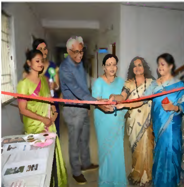
INAUGURATION OF ANNUAL EVENT 2018