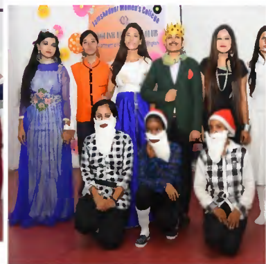
TEAM SNOW WHITE